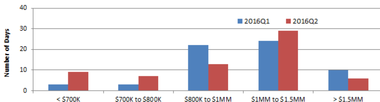
CHART 1: Distribution of Daily 99% Confidence 10-Day Hold VaR Statistics for the Total Trading Portfolio