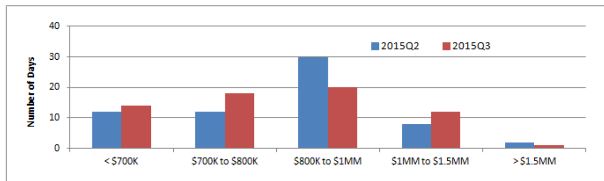
CHART 1: Distribution of Daily 99% Confidence 10-Day Hold VaR Statistics for the Total Trading Portfolio